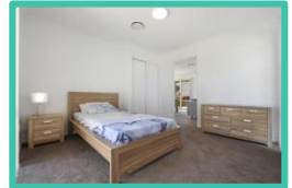
Internal photos are indicative only.

You will fall in love with this beautiful, spacious, freshly renovated, two bedroom villa. With beautiful valley views, features include modern kitchen and bathroom with his-and-hers sink, new carpet throughout, built-in wardrobes, air conditioning and garage.