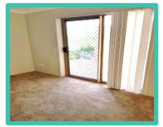
Internal photos are indicative only.

You will fall in love with this beautiful, freshly renovated, two bedroom villa. With beautiful valley views, features include modern kitchen and bathroom, new carpet throughout, built-in wardrobes, air conditioning and garage.