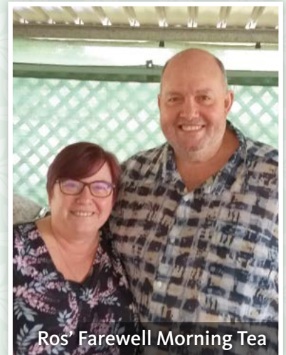
Ros' Farewell Morning Tea